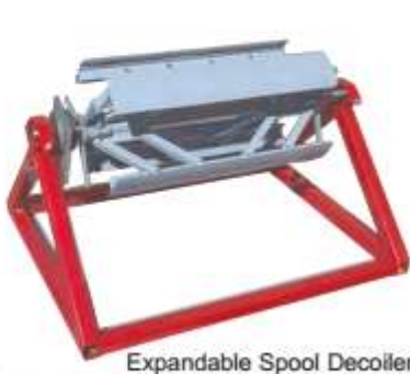
Expandable Spool Decoiler