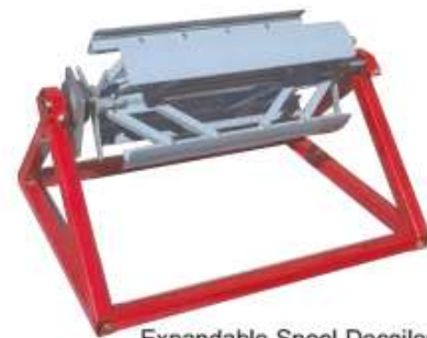
Expandable Spool Decoiler

Form Both 12" & 16" Wide Panels 304 Stainless Steel Tooling Industrial Grade Hydraulic System Notching Hydraulic Shear For Easy Assembly 4,000 lb. Capacity Expandable Decoiler With Brake & Stand Stiffening Ribs Limit Switch Measuring Device Hand Held Remote Controls